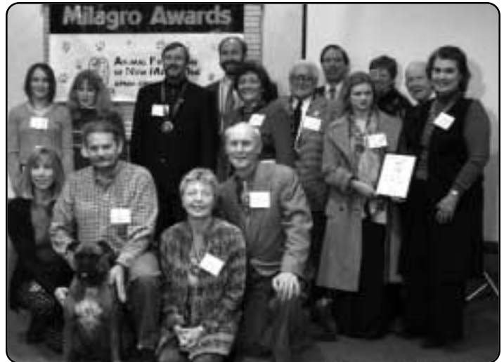
The 2001 Milagro Awards Dinner and Ceremony will be held Saturday, November 3 rd at the Hilton of Santa Fe, 100 Sandoval, Santa Fe. See APNM's web site at www.apnm.org for updates and nomination forms.