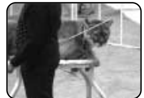
Wild animals, who spend their captive lives in cages and live under fear of punishment, are forced to perform silly and degrading tricks for circus audiences.

animals used in circuses do suffer. To help with this next effort, the animals need your presence and your voice at the council meetings! Until then, please call, email, write or fax Santa Fe's City Councilors.