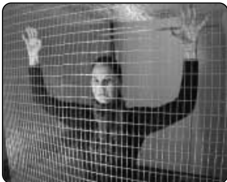
Actress and animal activist, Ali MacGraw, demonstrates the hideous conditions in which Coulston chimps spend their entire lives.

In interviews and affidavits obtained by APNM under the FOIA, Coulston employees and independent researchers provided (continued on page 3)